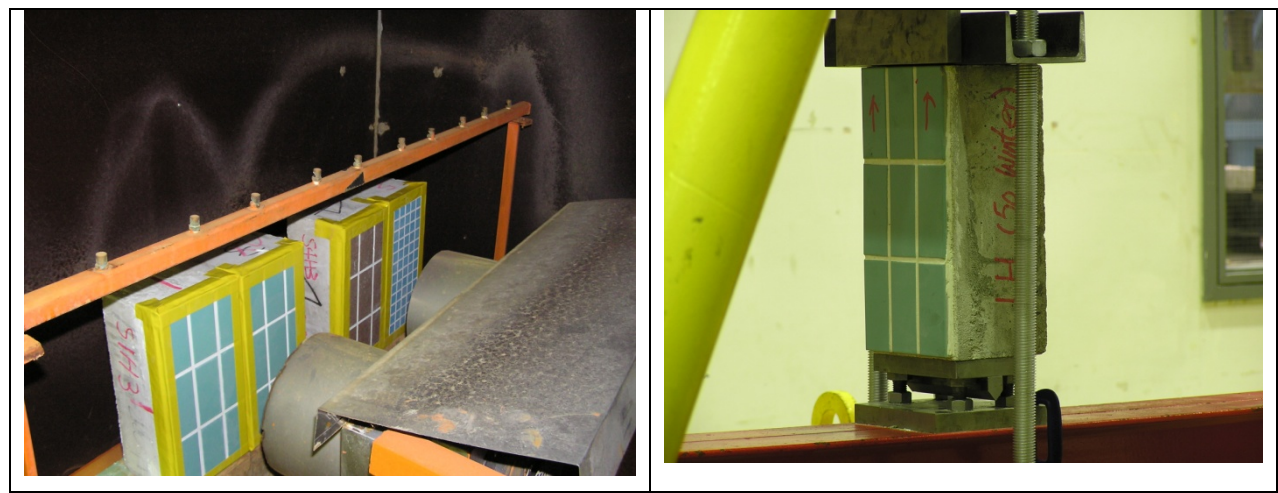
Fig. 3.2 Thermal and Moisture Cyclic Test and Shear Strength Test in Yiu et al. (2007)

Besides the HARF project on external wall tiles, there are at least two more indepth studies on wall tile failures in Hong Kong. The first one is Bowman et al.'s (2000) report to Hong Kong Construction Association for an investigation of the performance of ceramic wall tiling in Housing Authority residential buildings. Another one is Lo et al.'s (2007) study on the causes of wall tile failures at the corridors of public housing estates in Hong Kong. However, these two investigations were both on internal wall tiles and at housing estates owned by the Housing Authority. The former was based on site investigations and the latter was by means of semi-structured interviews and specifications comparison. The former found that it was the differential movement between materials that caused the failures, while the latter found that homogenous tiles may be too large and heavy to be supported by adhesive systems.